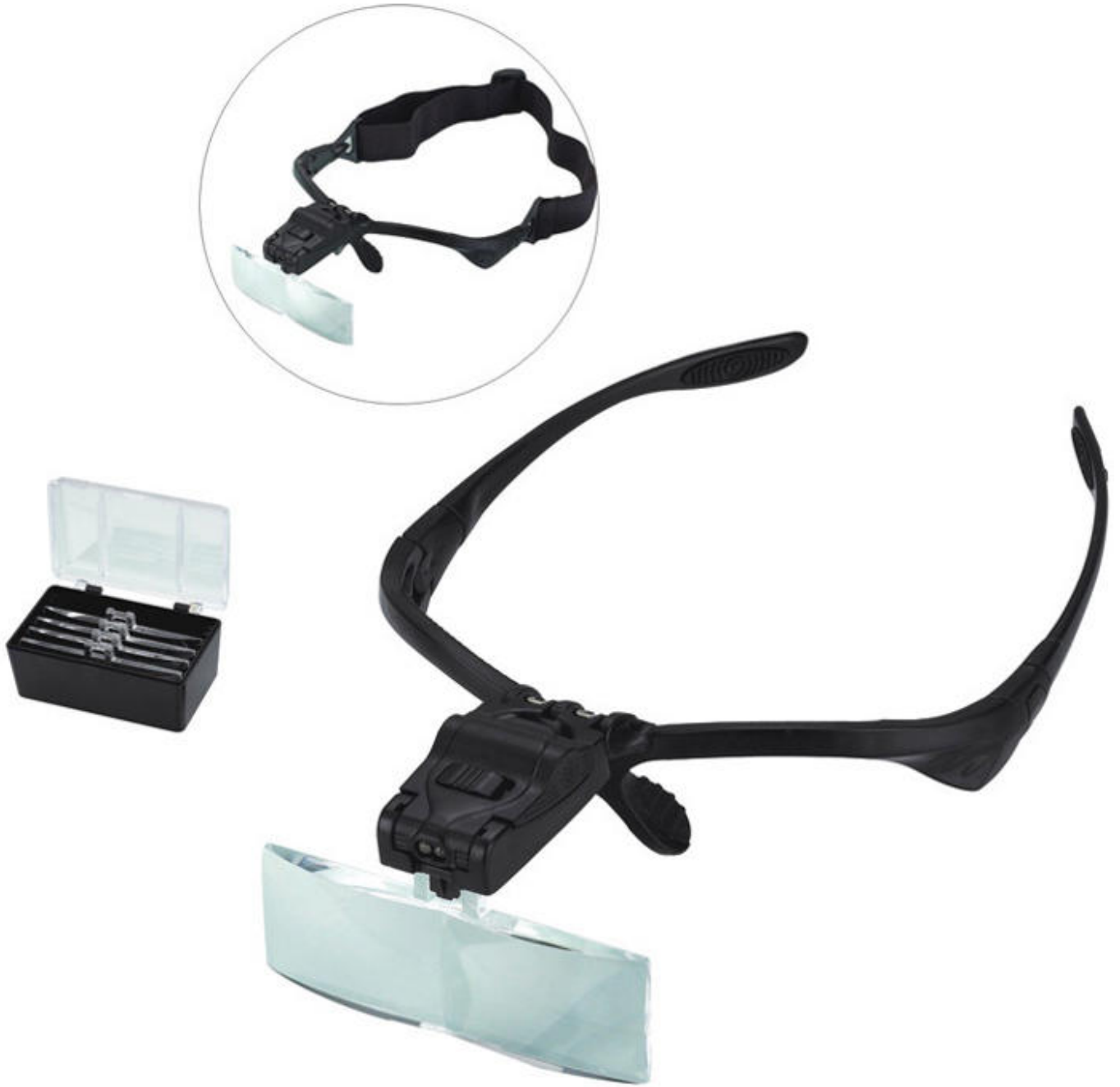
PATCHED Magnifier 1.0