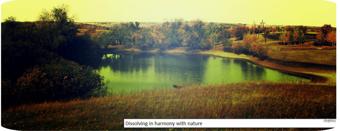
Dissolving in harmony with nature